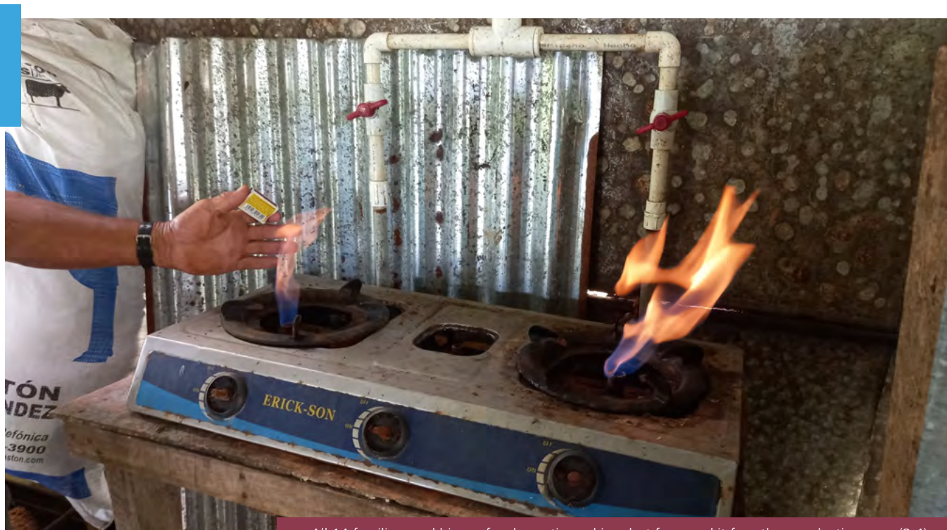
All 14 families used biogas for domestic cooking, but few used it for other productive uses. (2.4)

The project ultimately aims to build a multistakeholder partnership that will serve as a knowledge exchange platform to revive biogas technologies in Costa Rica. In the next steps, the findings will inform the development of capacity building activities to implement locally in the three communities, with the aim of replicating such activities in broader settings. The activities will be supported by the WISIONS pro-