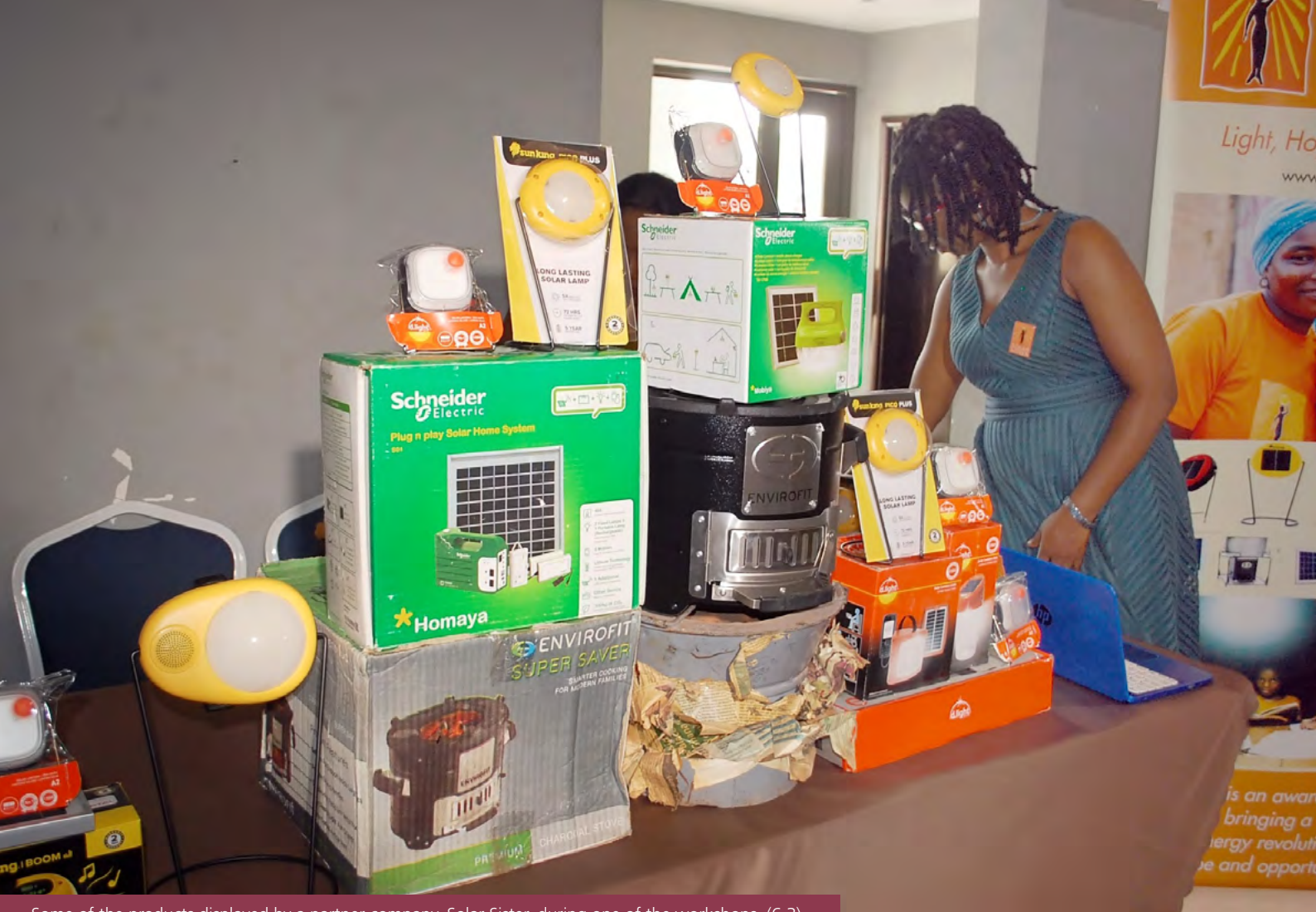
Some of the products displayed by a partner company, Solar Sister, during one of the workshops. (6.3)

The initiative had high impacts within the community, especially for the women. CTH received feedback that following the program, there was a transition from the dependence on kerosene and firewood for cooking to the adoption of cleaner cooking methods which brought about a noticeable reduction in the black carbon emissions within Aba leading to better health outcomes for the women and the community. Two primary factors were identified to be reasons for the transition; the women become more enlightened on the benefits of cleaner energy, and CTH (through its partners) provided the women with affordable renewable energy and clean cooking products.