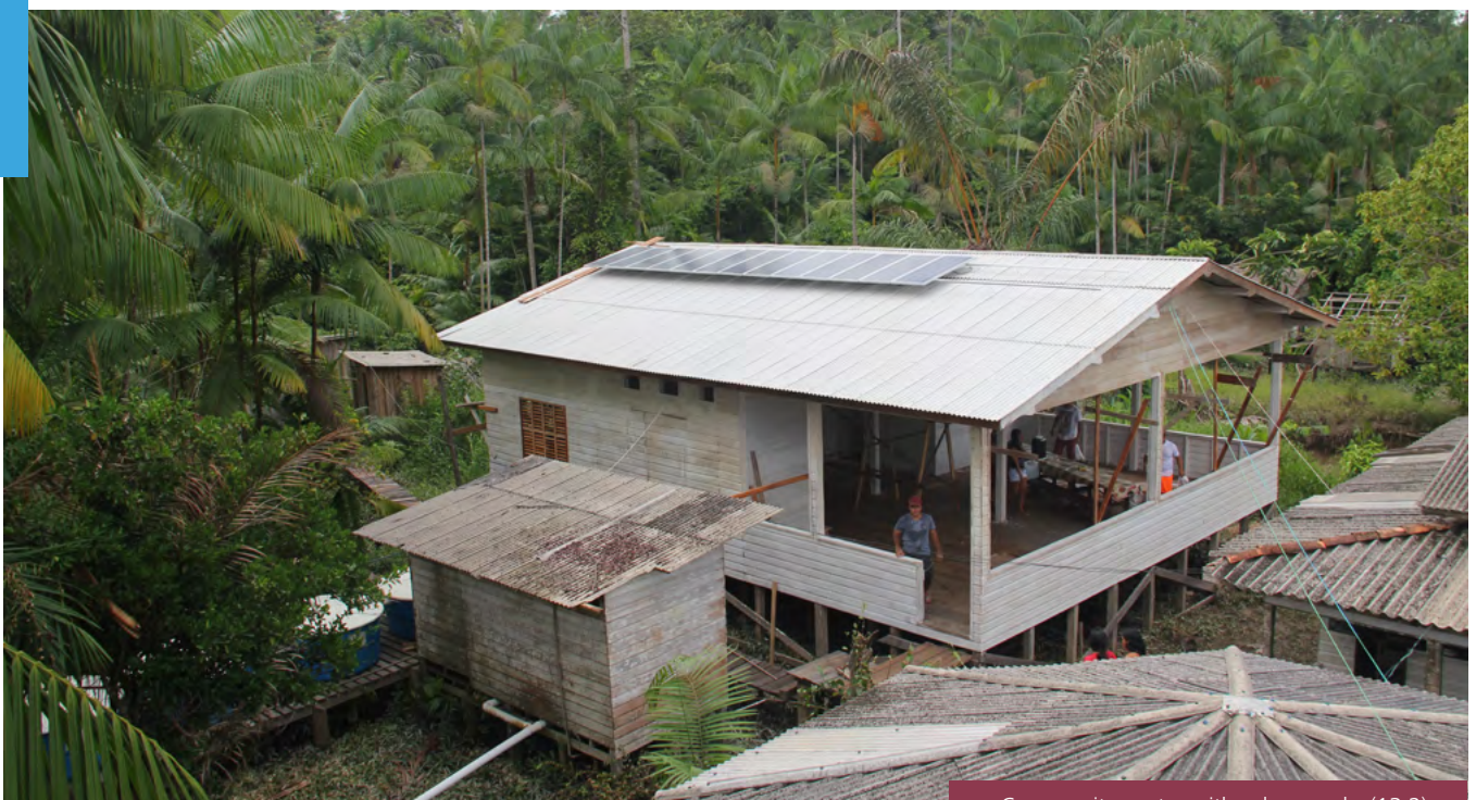
Community centre with solar panels. (13.2)