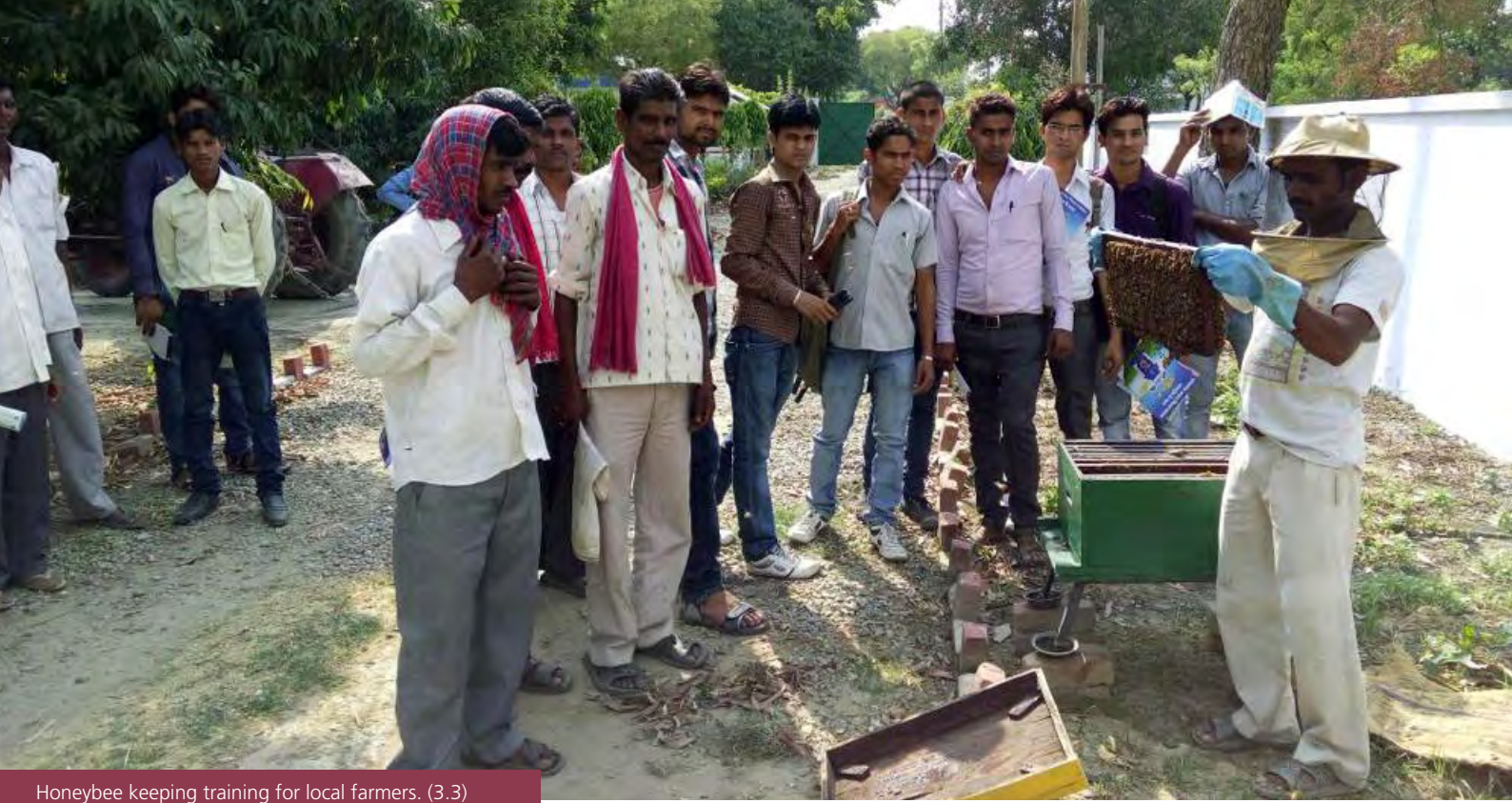
Honeybee keeping training for local farmers. (3.3)

inputs through the local government operated “Krishi Vigyan Kendra” (Agricultural Knowledge Center). There are also plans currently underway to help the farmers improve their bargaining power in the market by forming a cooperative society and subsequently, a Farmer Producer Organization, with support from the Krishi Vigyan Kendra and the National Bank for Agriculture and Rural Development (NABARD).