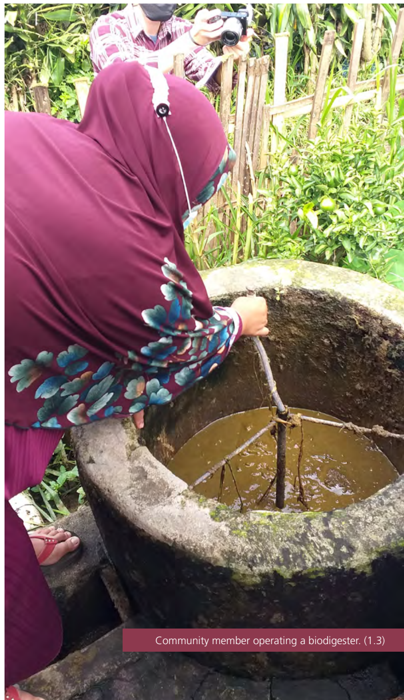
Community member operating a biodigester. (1.3)

The first challenge to deploy more biodigester in Cibodas Village is the limited land availability and its ownership. It happens not only for the installation of biodigester but also for the animal husbandry area. Some of Cibodas' agricultural land has been changed to eco-tourism resorts. To be able to install one biodigester reactor, a farmer needs at least 4-10 m 2 of the area, including space for the bio-slurry and its piping access. Not every farmer has this privilege. To overcome this challenge, people usually build biodigester close to their homes to reduce the access and the use of land.