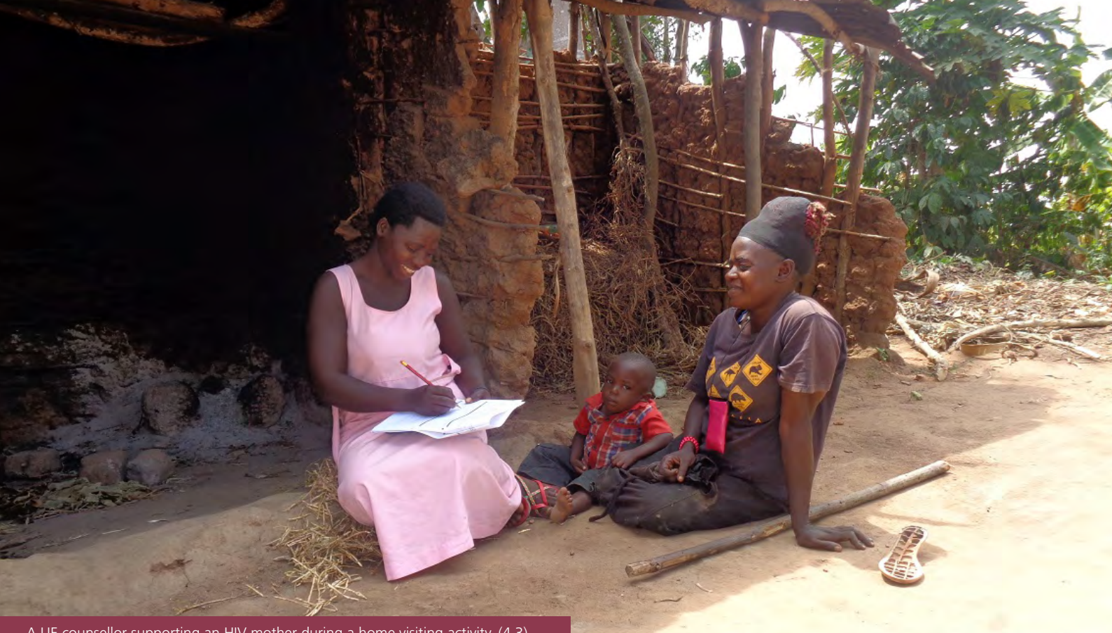
A UE counsellor supporting an HIV mother during a home visiting activity. (4.3)

fees, food, clothes, and future investments as a result of increased harvests from their home garden farms.