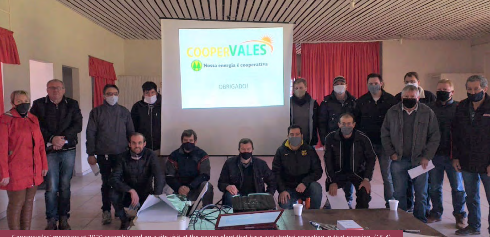
Cooperavales' members at 2020 assembly and on a site visit at the power plant that have just started operation in that occasion. (16.4)