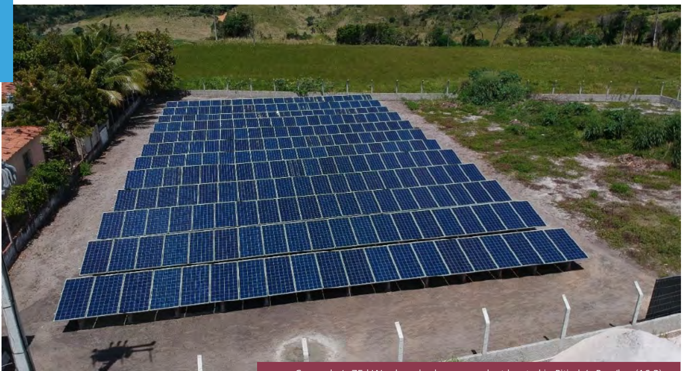
Coopsolar's 75 kWp shared solar power plant located in Pitimbú, Paraíba. (16.3)