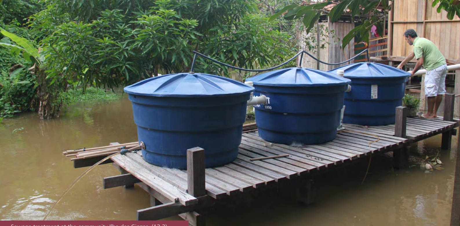
Sewage treatment at the community Ilha das Cinzas. (13.3)