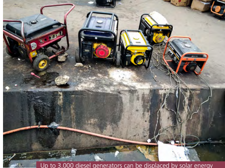
Up to 3,000 diesel generators can be displaced by solar energy in the Wuse market. (11.2)

the potential for high impact on the economy 1 . No burdens and negative consequences have emerged from the initial use of the mini-grid by the market community.