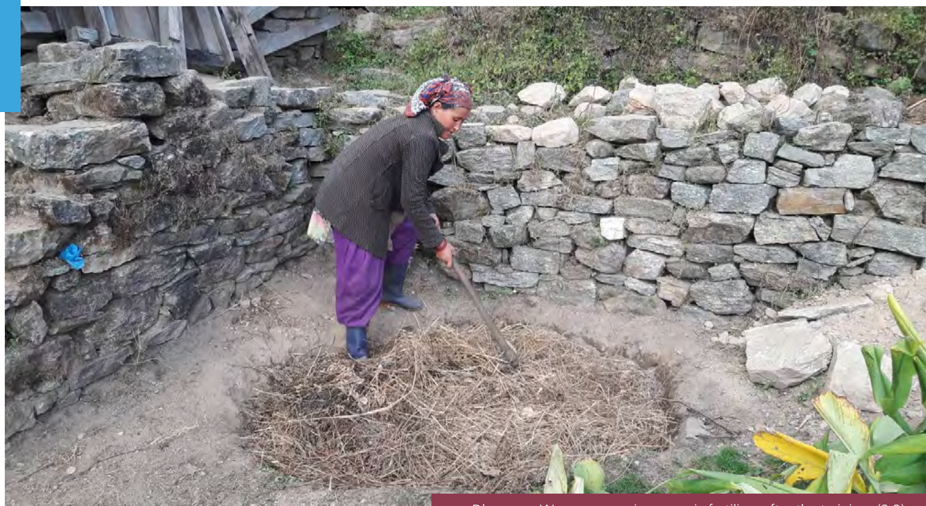
Dhapsung Woman preparing organic fertilizer after the training. (9.2)

Digo Bikas Institute (DBI) which is a research and advocacy organization committed to promote ecological sustainability and social equity at the policy and community levels, intervened and worked to empower women in Dhapsung. At first the Women's