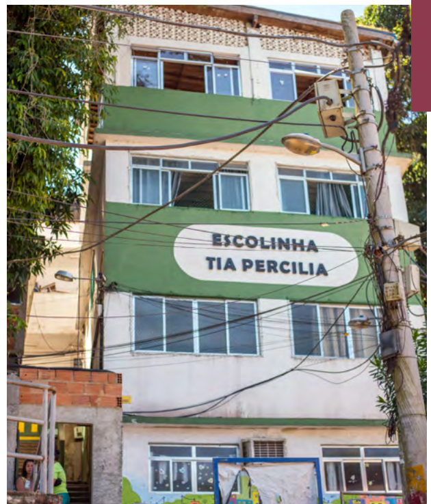
Local children's school where Revolusolar installed solar energy. (14.5)

Contact: eduardo.avila@revolusolar.com.br