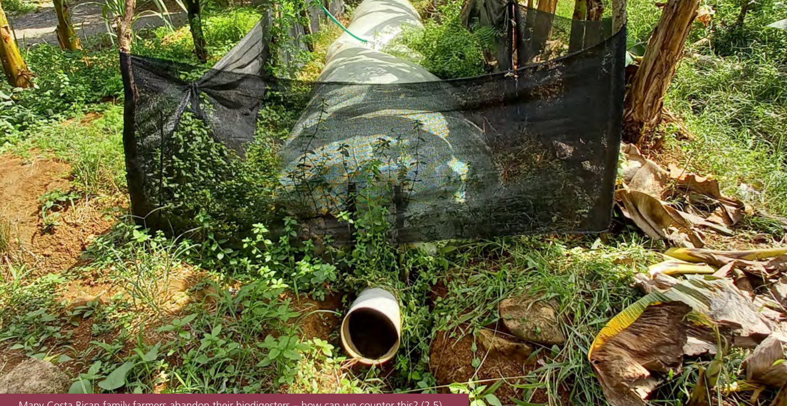
Many Costa Rican family farmers abandon their biodigesters – how can we counter this? (2.5)

gramme 1 and will include peer-to-peer dialogues, introduction to technical concepts and procedures and hands-on training sessions. The workshops will take place on the family farms and will involve representatives of 10 to 15 families from the same community. The aim is to reach families who have never owned a biodigester, as well as those who have abandoned the technology. The next steps will also explore strategies to exploit the full potential of biodigesters, including their use in productive activities and as a reliable and sustainable source of fertiliser. We hope this will help to rebuild trust in the technology among Costa Rican family farmers and all the relevant actors in the sector.