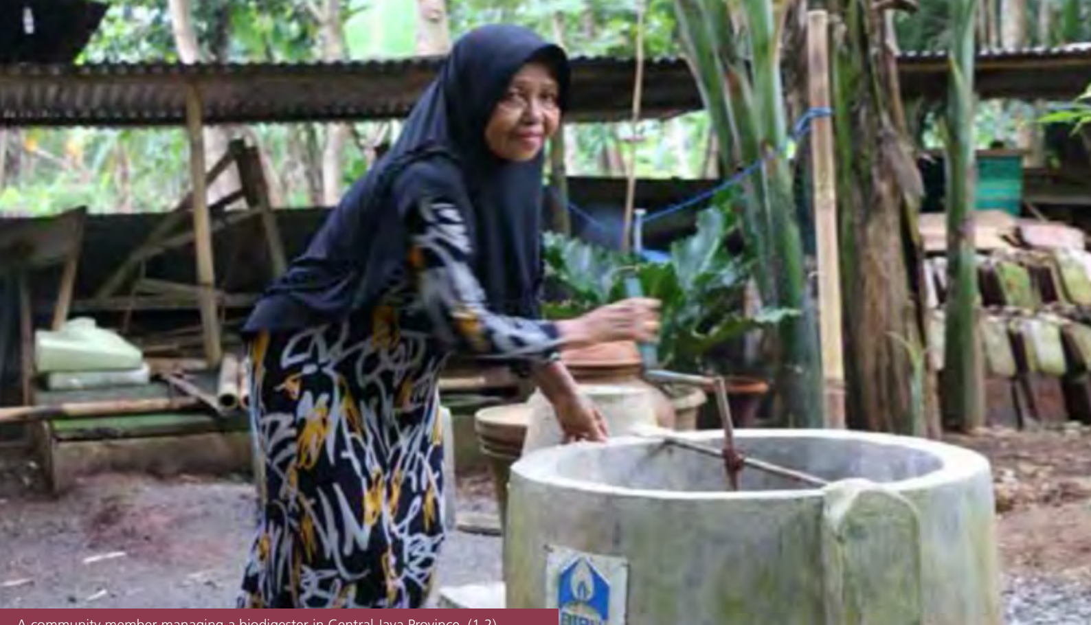
A community member managing a biodigester in Central Java Province. (1.2)