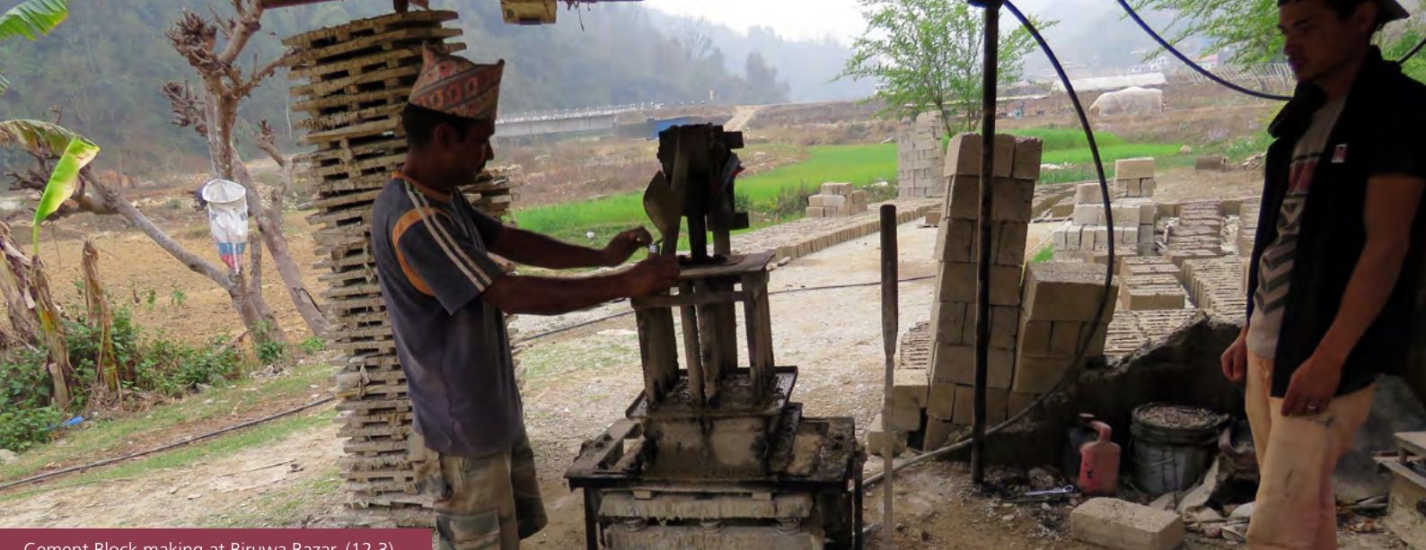
Cement Block making at Biruwa Bazar. (12.3)