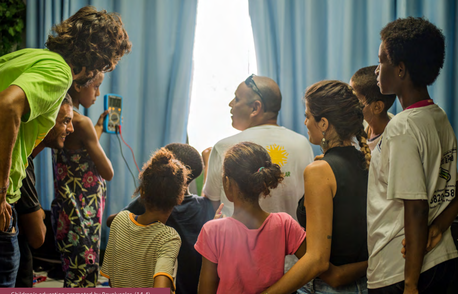
Children's education promoted by Revolusolar. (14.4)

restrictions, which can be neutralized with government incentives or private hybrid capital financing mechanisms, which involve, in addition to donations, some repayment by the beneficiaries (with part of the savings in the electricity bill that are having – including this repayment model we are validating with the new pilot project of the cooperative).