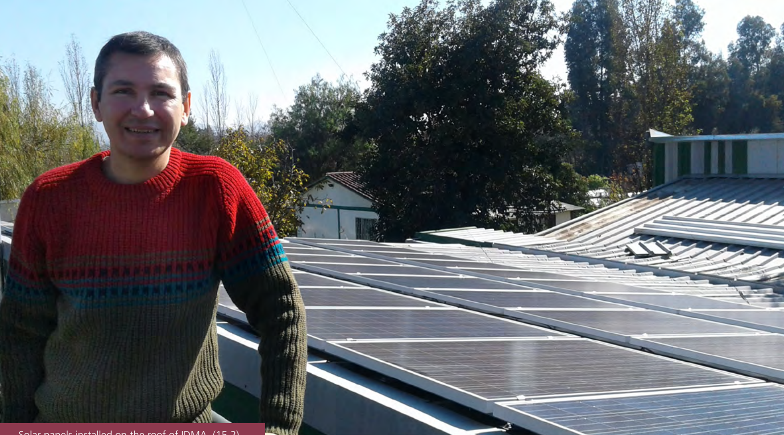
Solar panels installed on the roof of IDMA. (15.2)

aware of the importance of assuming an active role and demanding policies in favour of citizen energy.