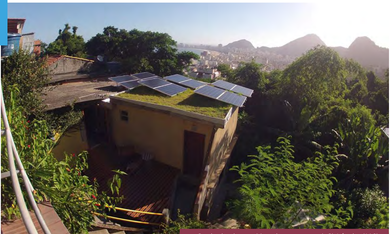
Revolusolar: democratizing solar energy access in Rio's favelas. (14.2)

To foster community engagement and autonomy, we have developed our own methodology for sustainable development through solar energy – the Solar Cycle, which involves, in addition to installations, professional training for solar installers, environmental education for children and youth. The formation of a local team capable of installing and maintaining the systems is essential for the project's long-term success and the creation of local autonomy. Thereby, it generates employment and local income as the solar energy market grows exponentially in Brazil and generates thousands of jobs (so far there are about 300,000 new jobs created, according to the Brazilian Association of Photovoltaic Solar Energy), which is very important in the context of high unemployment rate and economic crisis in the country. Children's