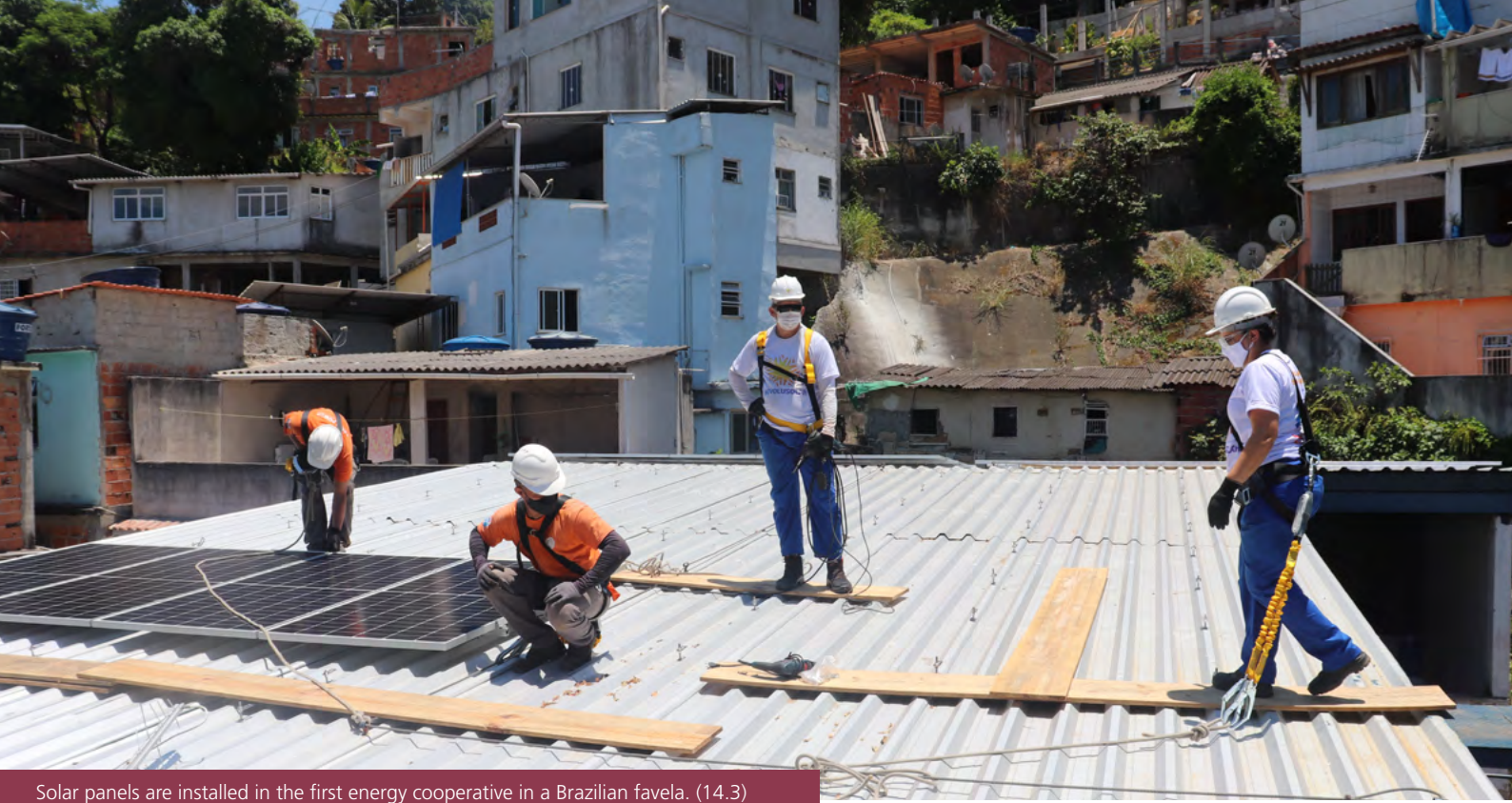
Solar panels are installed in the first energy cooperative in a Brazilian favela. (14.3)

education also strongly contributes to the continuity of the project in the long term, and to the engagement of the families, for the Solar Energy Revolution. Savings on electricity bills is the main direct economic benefit of the solar cooperative project. Electricity tariffs rose 106% in the last decade in Rio de Janeiro, far above inflation in the period. With their own generation of solar energy, the cooperative beneficiaries can save up to 90% of energy expenses, allowing reinvestment in leisure, culture and education.