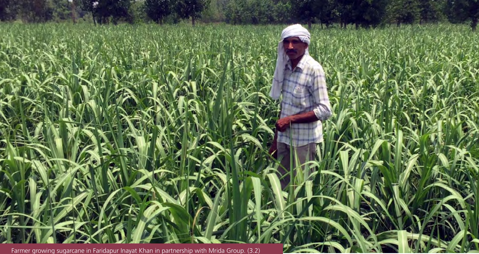
Farmer growing sugarcane in Faridapur Inayat Khan in partnership with Mrida Group. (3.2)

simple matters such as changing bulbs, batteries etc., fault diagnosis in case of issues with the grid and contact a Mrida technician if the issues were serious. This member was paid a nominal amount from the funds collected. The second channel was that any surplus payments collected would contribute towards a village development fund held at a local bank. This fund could be used to better the community welfare as the VDC saw fit and would also serve as a source of micro-credit for any villager's entrepreneurial or upskilling aspirations. This was a key initiative that linked energy access to non-energy aspirations of the community.