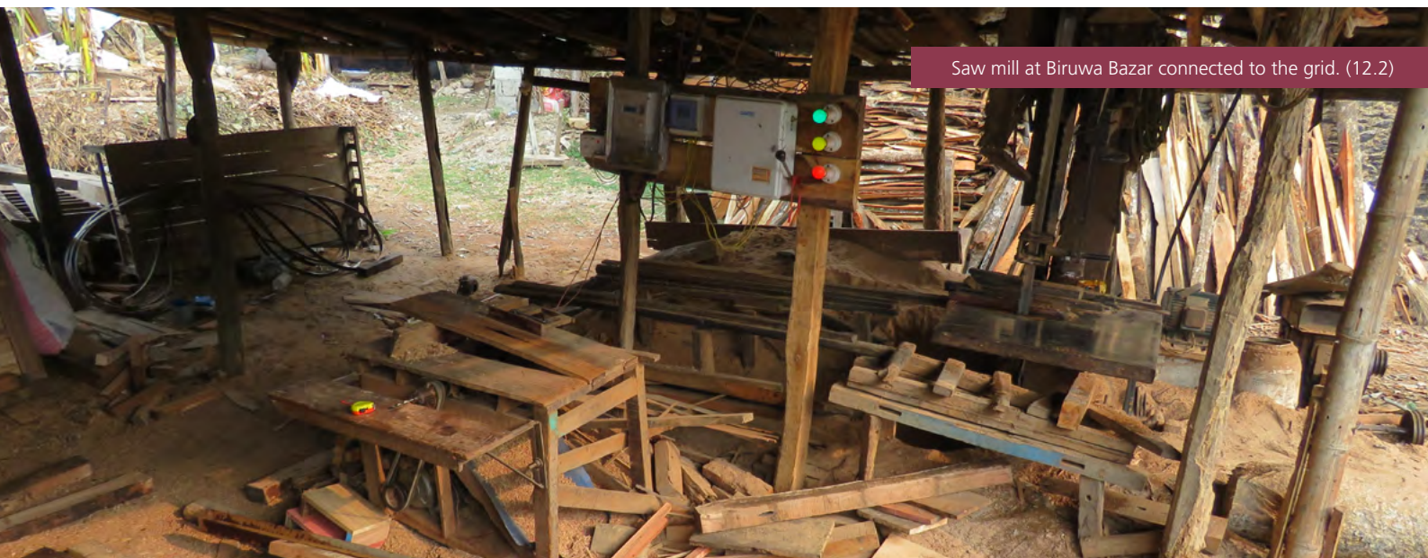
Saw mill at Biruwa Bazar connected to the grid. (12.2)