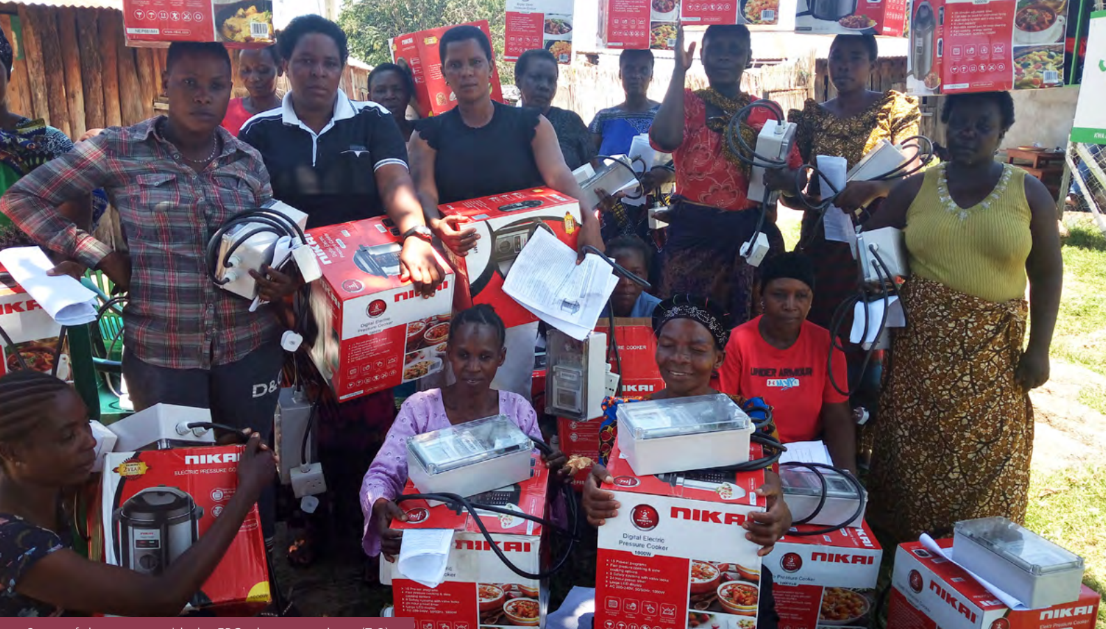
Some of the women with the EPCs they were given. (7.2)

reflecting the fact that the women have identified the costs and benefits enough to make a decision on whether to continue usage. Towards the end of the project, the Tanzanian government enforced a policy that reduced the tariffs paid for electricity to 100 shillings (0.04 dollars). With the costs of cooking reduced, pilot users begin to use their EPCs with renewed enthusiasm and the usage spiked to higher levels than when it was newly introduced.