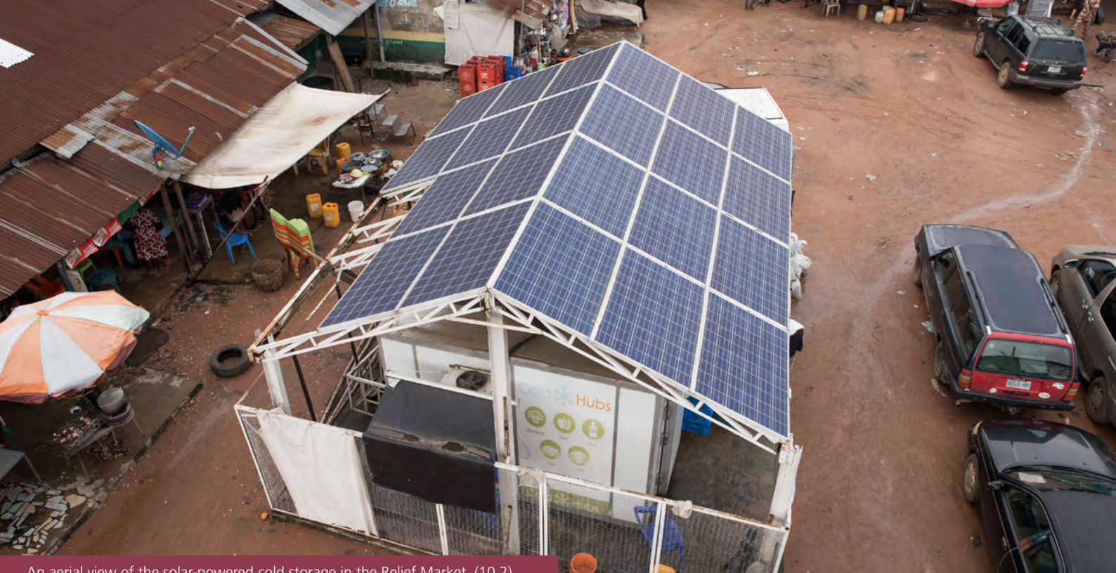
An aerial view of the solar-powered cold storage in the Relief Market. (10.2)