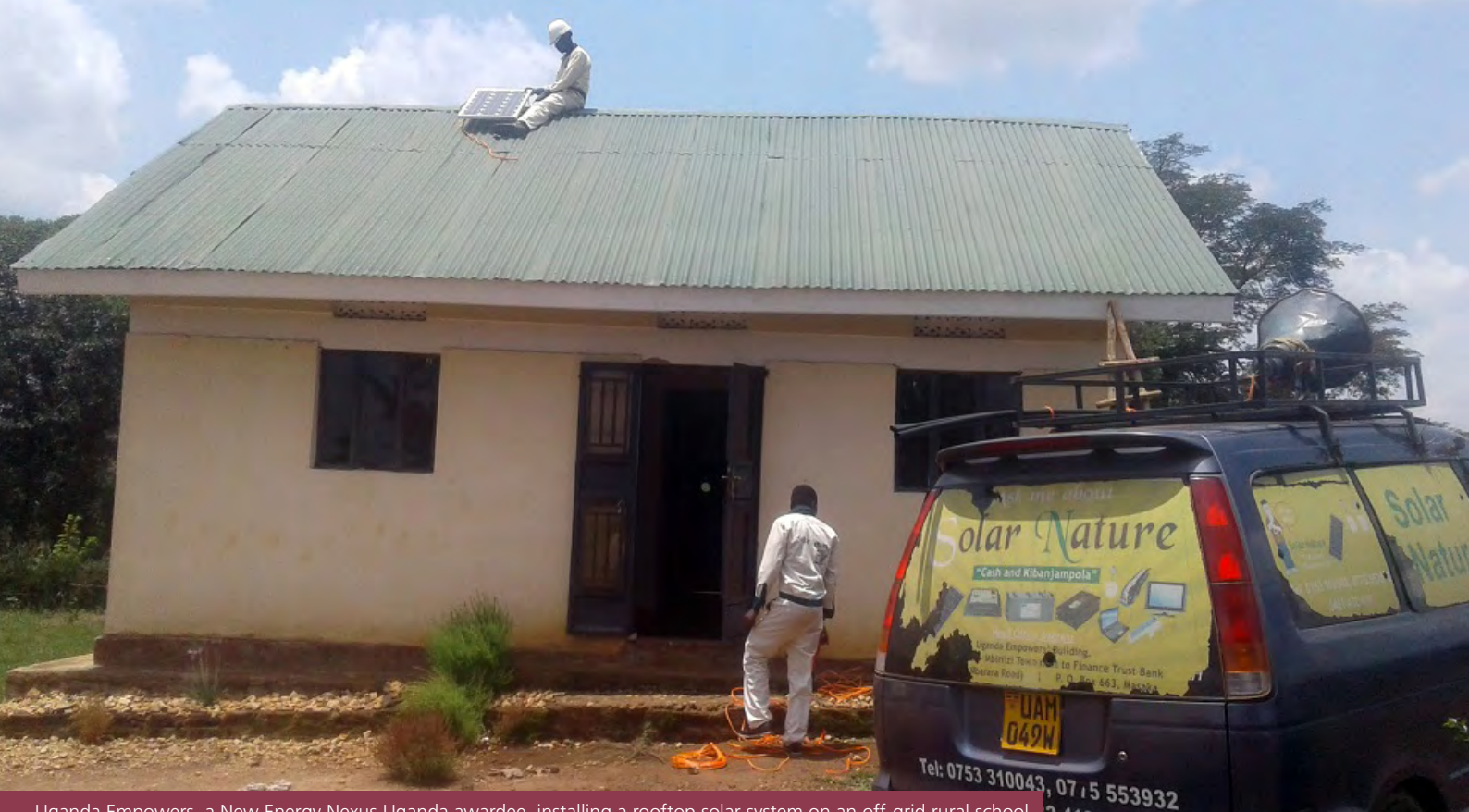
Uganda Empowers, a New Energy Nexus Uganda awardee, installing a rooftop solar system on an off-grid rural school building. (5.2)

challenges through domestic cleantech solutions such as improved cookstoves and solar water pumps.