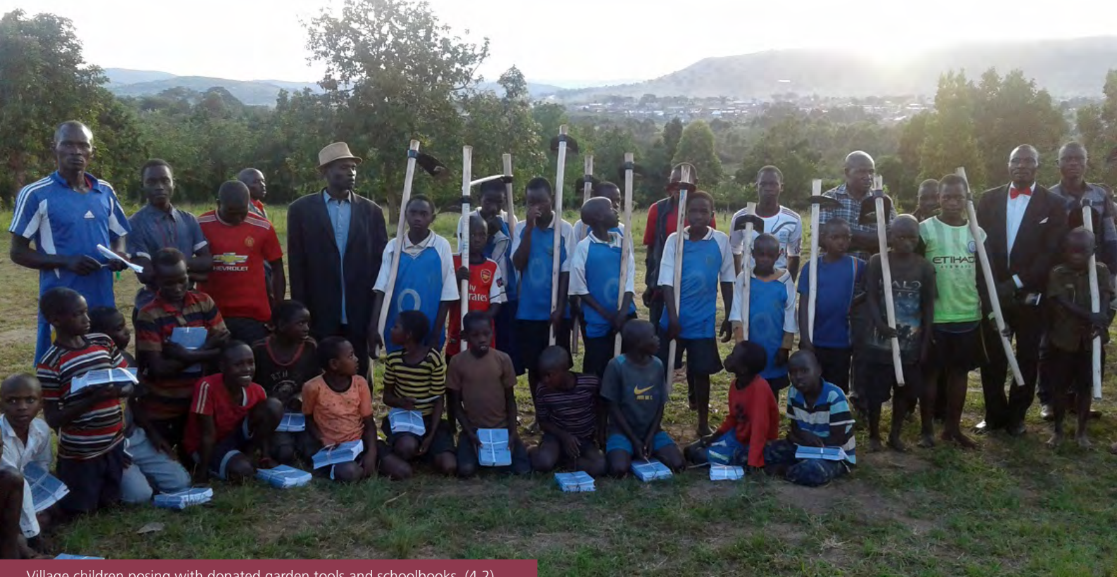
Village children posing with donated garden tools and schoolbooks. (4.2)