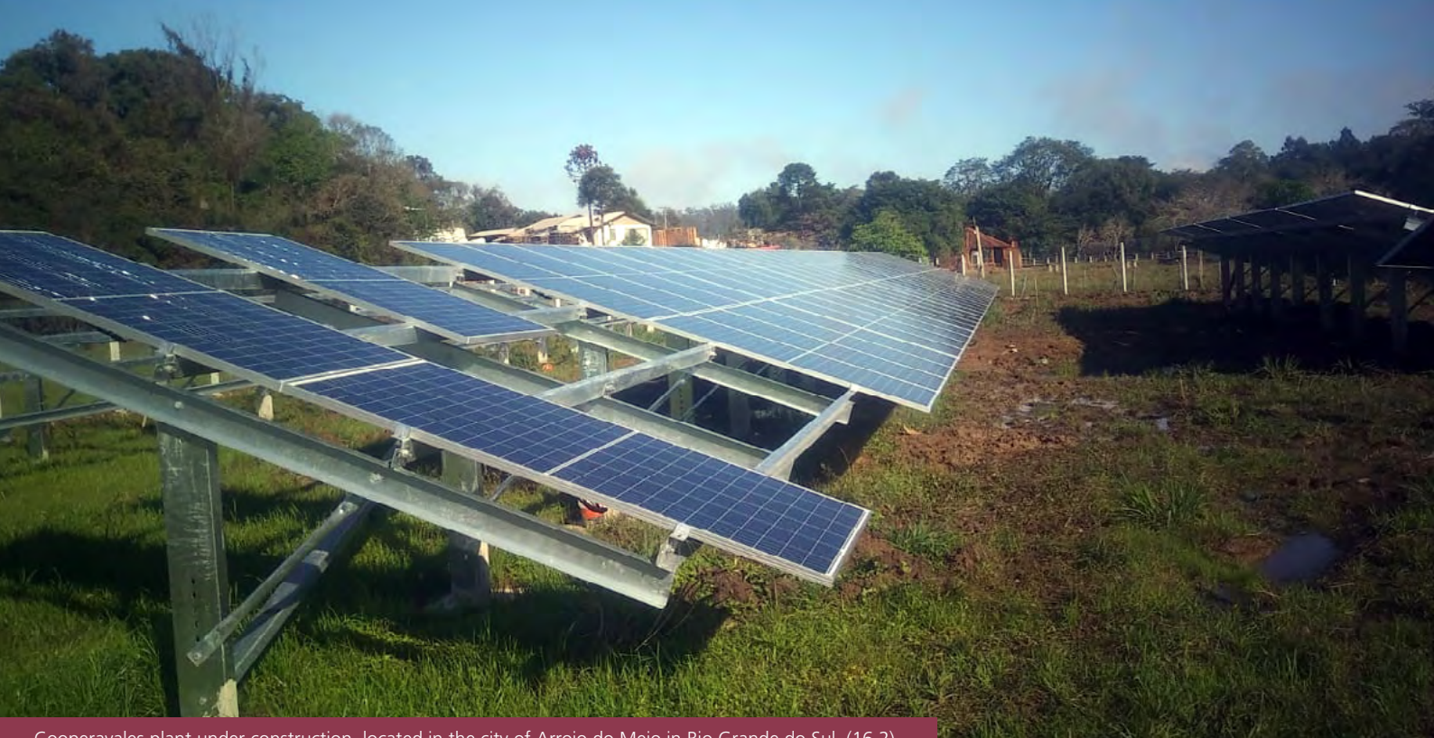
Cooperavales plant under construction, located in the city of Arroio do Meio in Rio Grande do Sul. (16.2)

net-metering scheme, in which prosumers (producers-consumers) can inject their surplus energy into the grid generating energy credits in a one-to-one scheme (each exported kWh generates credits of one kWh). In November 2015, the regulation was revised and ANEEL published REN 687/2015, which made possible the execution of shared distributed generation projects through consortia or cooperatives.