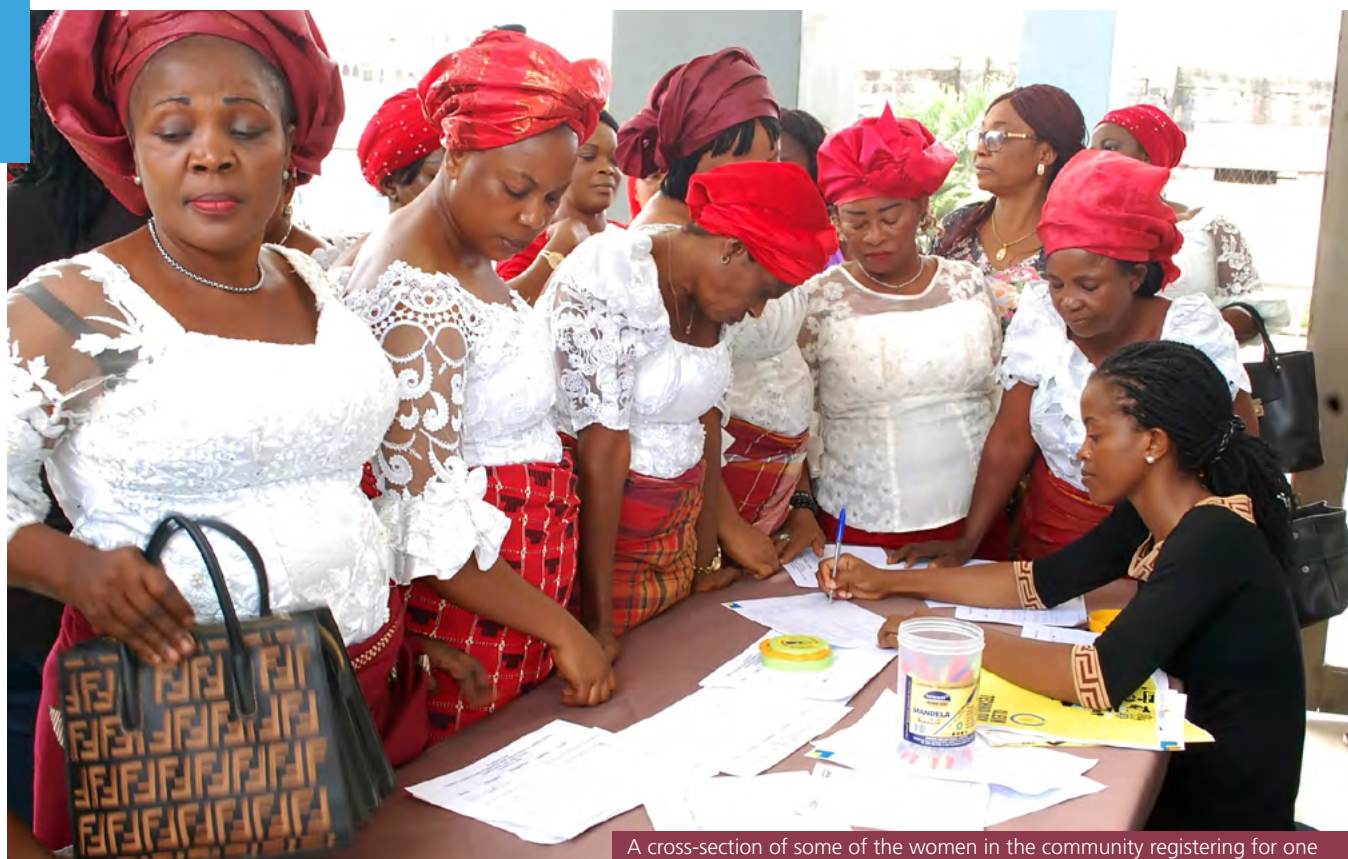
A cross-section of some of the women in the community registering for one of the enlightenment campaigns. (6.2)

Following the Abia state programs, CTH carried out a survey to assess the impact of the workshops. From the questioned individuals, 80% confirmed they were satisfied with the training, workshops, engagements, and outreach emphasizing that they understood the benefits of these technologies for their busines-