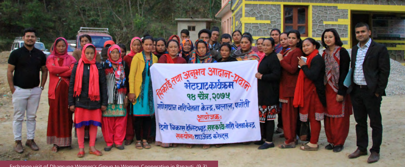
Exchange visit of Dhapsung Women's Group to Women Cooperative in Panauti. (9.3)

nical know-how of using it along with the grid. These kinds of scenarios exist everywhere in Nepal where after some years of mini-grid operations, national grid extensions become more feasible. DBI in consultation with the Rural Municipality and funds from the German Embassy proposed a prosumer model for the mini-grid. This is a grid-connected model where the community uses the electricity when needed and sells the extra energy to the national or local grid, thereby providing aid to the community's effort to foster economic development. However, the policy regarding community scale prosumer model is not in practice and donor agencies lack planning in converting community owned microgrids into prosumer models, from the planning to execution phase. Regardless, the 16kW Mini-grid is currently used to power a few lights at the nearby school, which is <1% of current capacity of mini-grid.